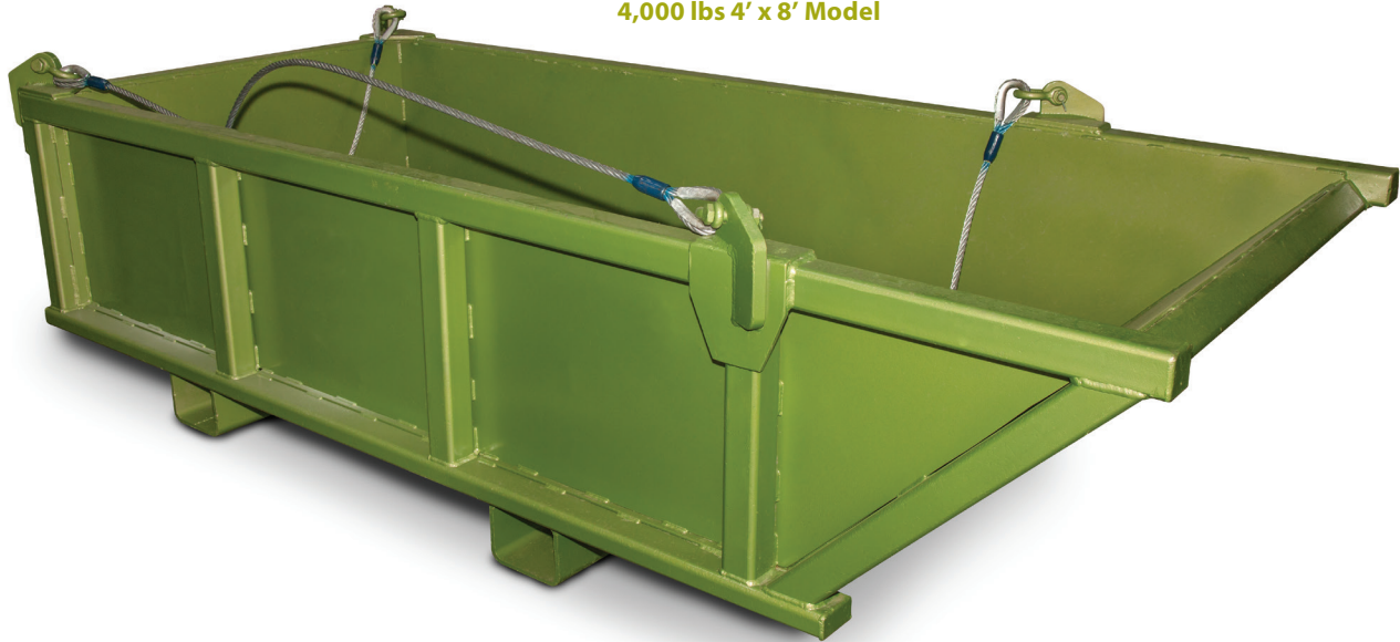
4,000 lbs 4' x 8' Model