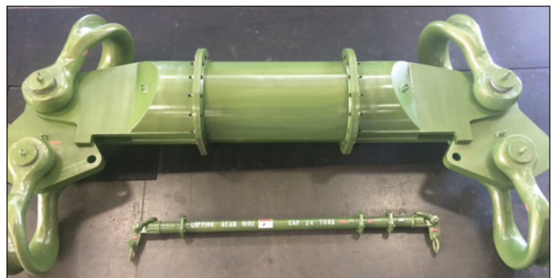
Pictured above is a MOD 1000 with a MOD 24 below for size comparison. The MOD 1000 features a 5 ft. strut with end units and shackles.

Green shading reflects rental inventory. •Beam weights calculated without top rigging and may vary depending on strut configuration. * Spans available in 1 foot increments